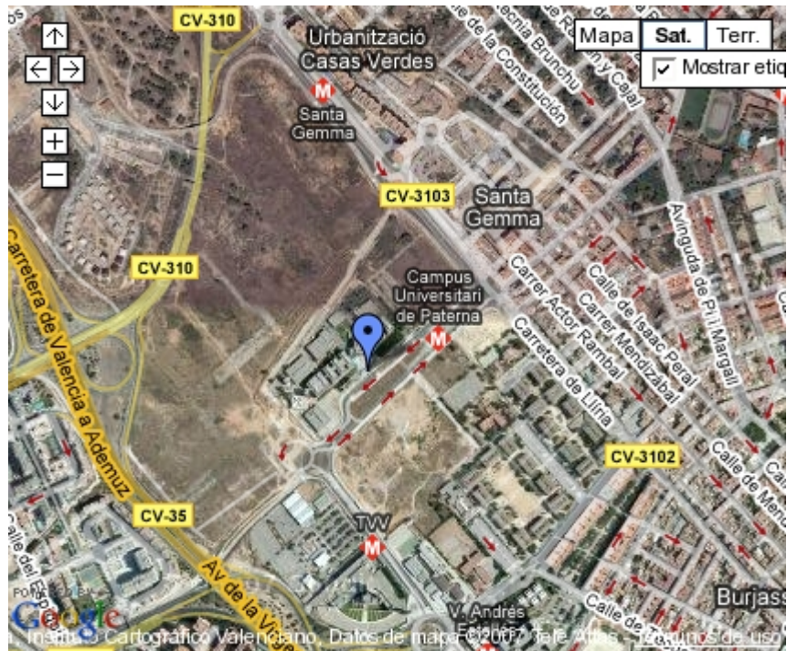
Figure 2: IFIC (blue marker) and underground stop TVV.