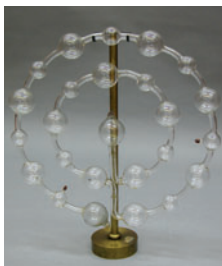
Glass helix tube with spheres to observe electrical discharges in gaseous atmosphere