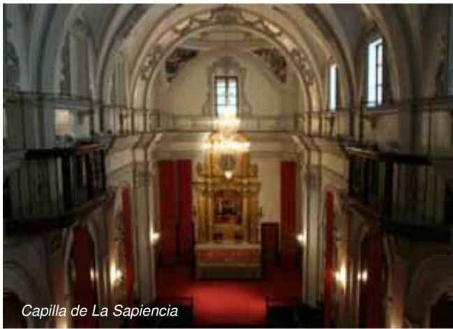
Capilla de La Sapiencia